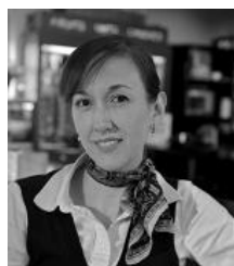
The Casper Professorship (2014)