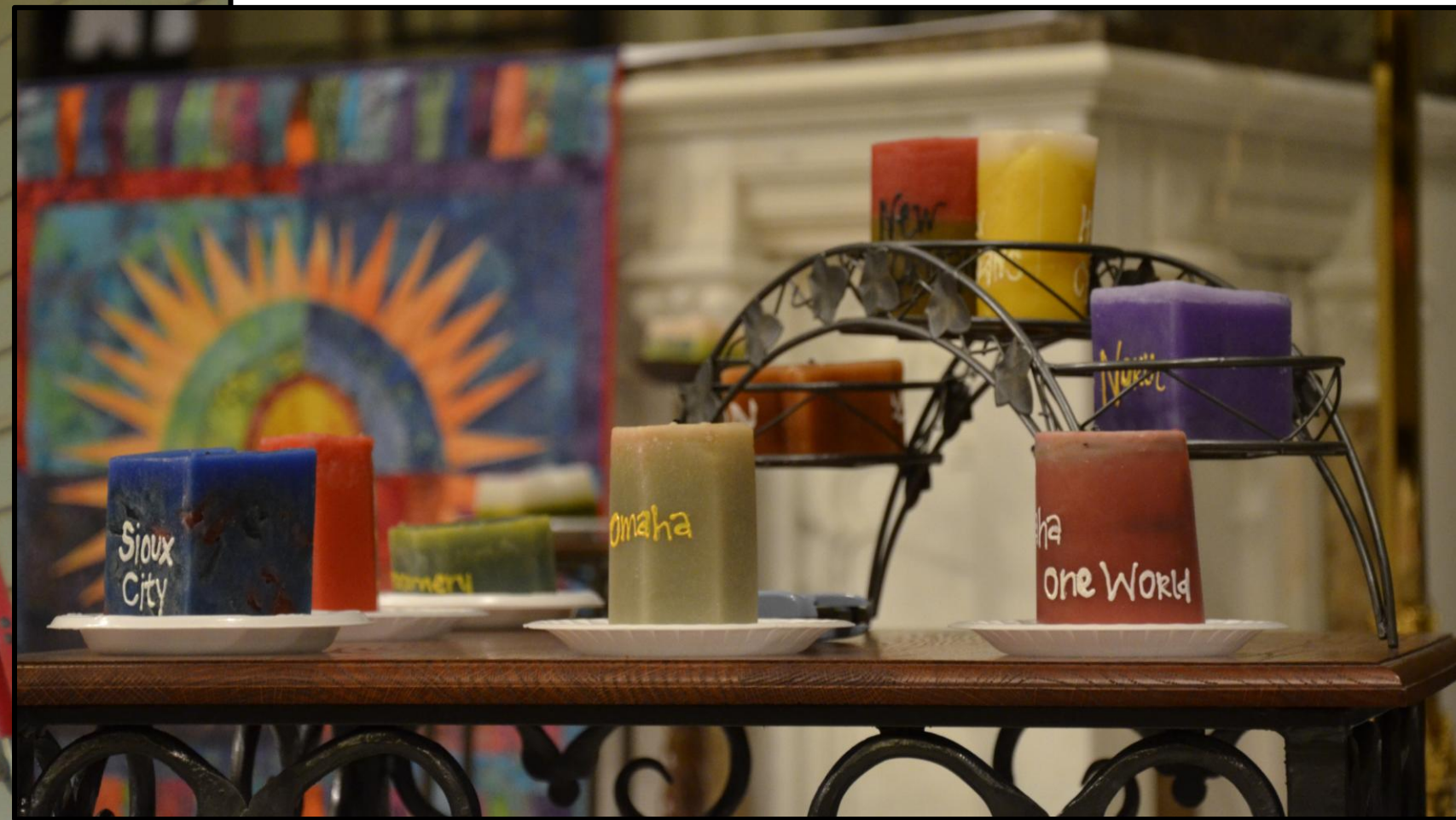
All pictures are from our Fall Break Service Trips Program 2011