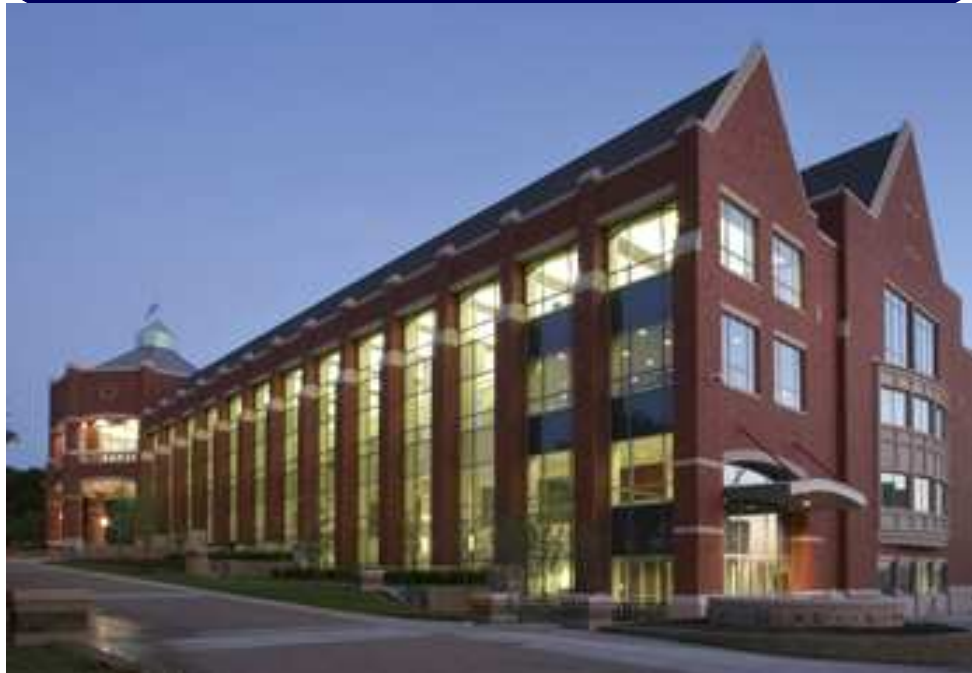
Harper Center for Student Life & Learning – Home of the John P. Fahey Career Center