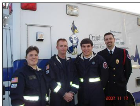
2nd Place Crescent Fire Crescent, IA