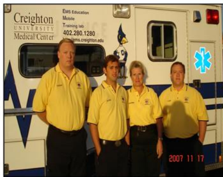
2nd Place Flagler County Fire Bunnell, Florida