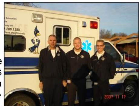
3rd Place West Des Moines EMS Des Moines, Iowa