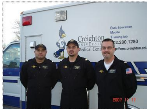
1st Place Life Net Omaha, Nebraska