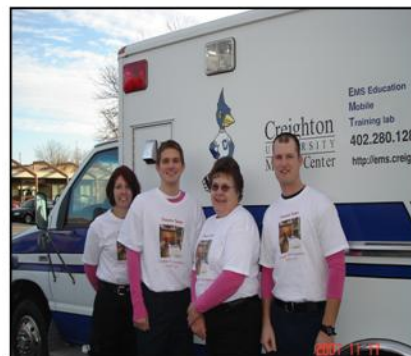
1st Place M&M Lifesavers Omaha, Nebraska