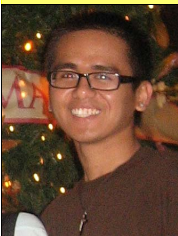
Achiever, Focus, Relator, Discipline and Consistency