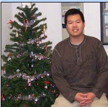
Song anxiously awaits the arrival of Christmas.