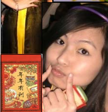
I am wearing my traditional dress for the New Years event! Happy New Year everyone, from me to you!!! That envelop has $100 "COME AND GET IT!"