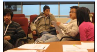
Peer-2-Peer mentors discuss important issues during their workshop.