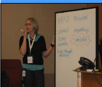
Peer-2-Peer mentors listen to important advice from a speaker.