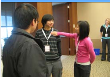
Peer-2-Peer mentors learn about their strengths while at a training workshop.