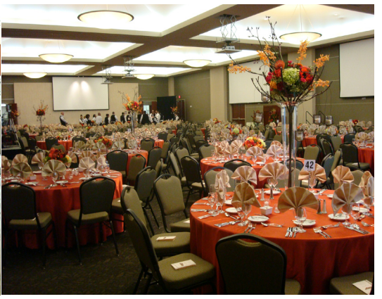
Lower Level (1)