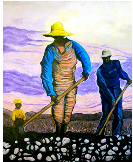
Exhibit in the Office of Multicultural Affairs features works by noted Omaha based African American artist Neville Murray

Murray is an Impressionist artist, whose work depicts the movement of people searching for better lives, and the ramifications of those migrations.