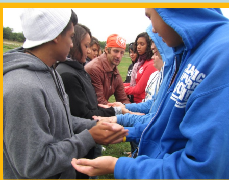
Learning to lift safely for a game of Light-As-A-Board.