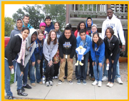
First Year Markoe Leaders