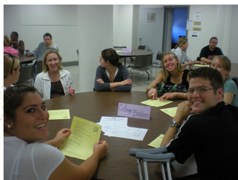
Excitedly waiting to get matched.