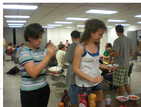
Ice cream and toppings and friendship, oh my!