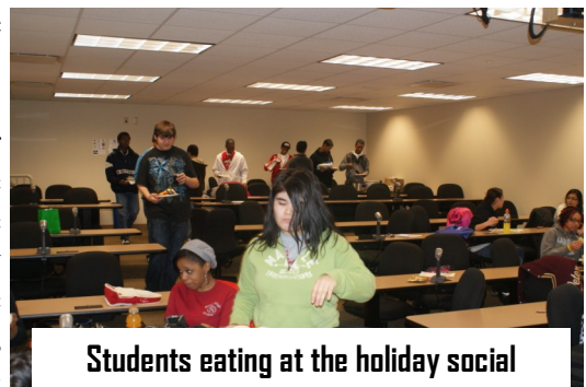
Students eating at the holiday social

Happy New Year! I hope everyone had a wonderful holiday season and is ready to have another productive year. The Saturday Academy ended its year with skills review from Kaplan and the students taking their first of 4 college entrance exams, the SAT. The last day of the class was a holiday social where the students had a gift exchange, shared some food, and watch the wonderful "Elf"!