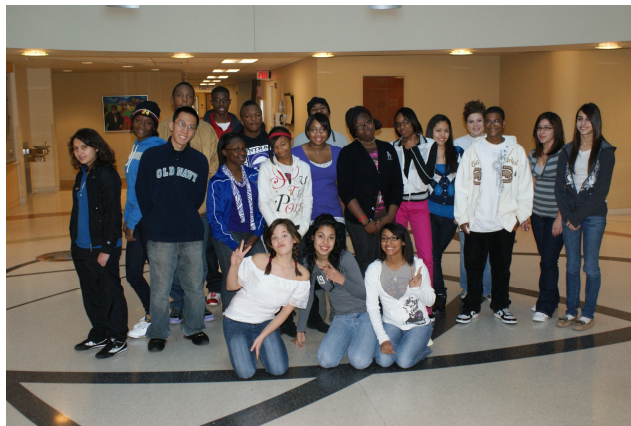
HCOP Saturday Academy Students

HCOP contacted over 70 students, received 37 applications, and interviewed 27 students for the Saturday Academy. The program selected 25 students representing 8 different schools in the OPS area; Bryan, Burke, Benson, Central, Marian, Mercy, North, and St. Peter Claver. The GPA average for the class is 3.44 . The program has high expectations of these students and have hard work planned in maintaining the high GPAs as well as continued progress in increasing ACT scores.