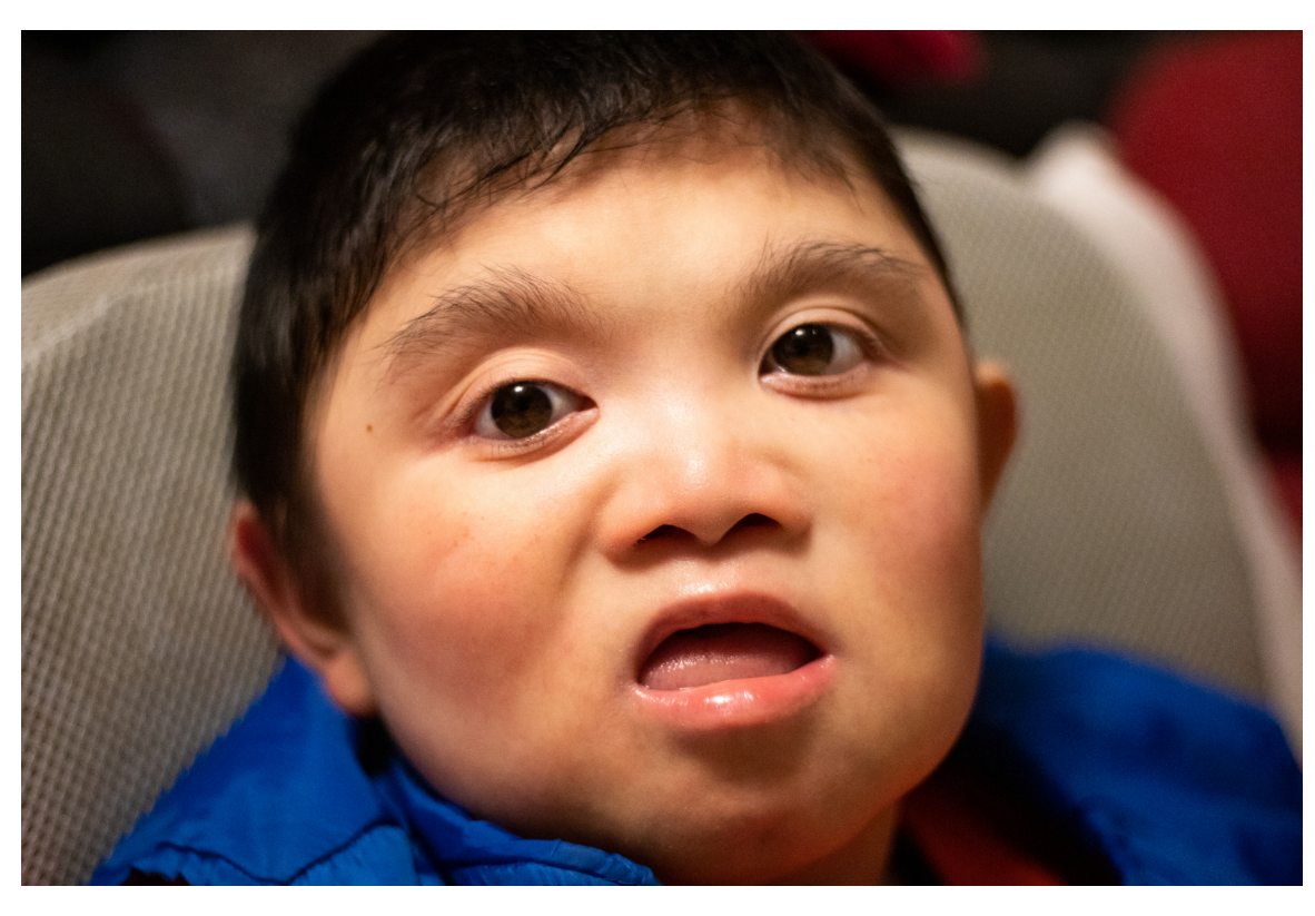
LIED ART GALLERY

Gallery Hours: Monday – Friday 8 am – 8 pm, Saturday – Sunday 10 am – 4 pm Closed for EASTER BREAK March 28-April 1