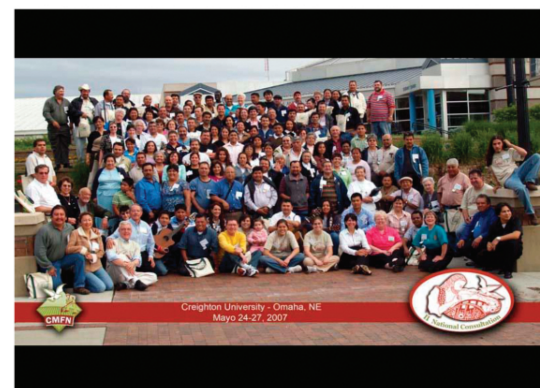
II National Consultation: 156 Migrant Leaders