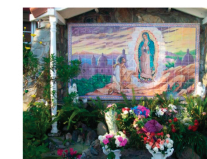
Altar Fresno, California