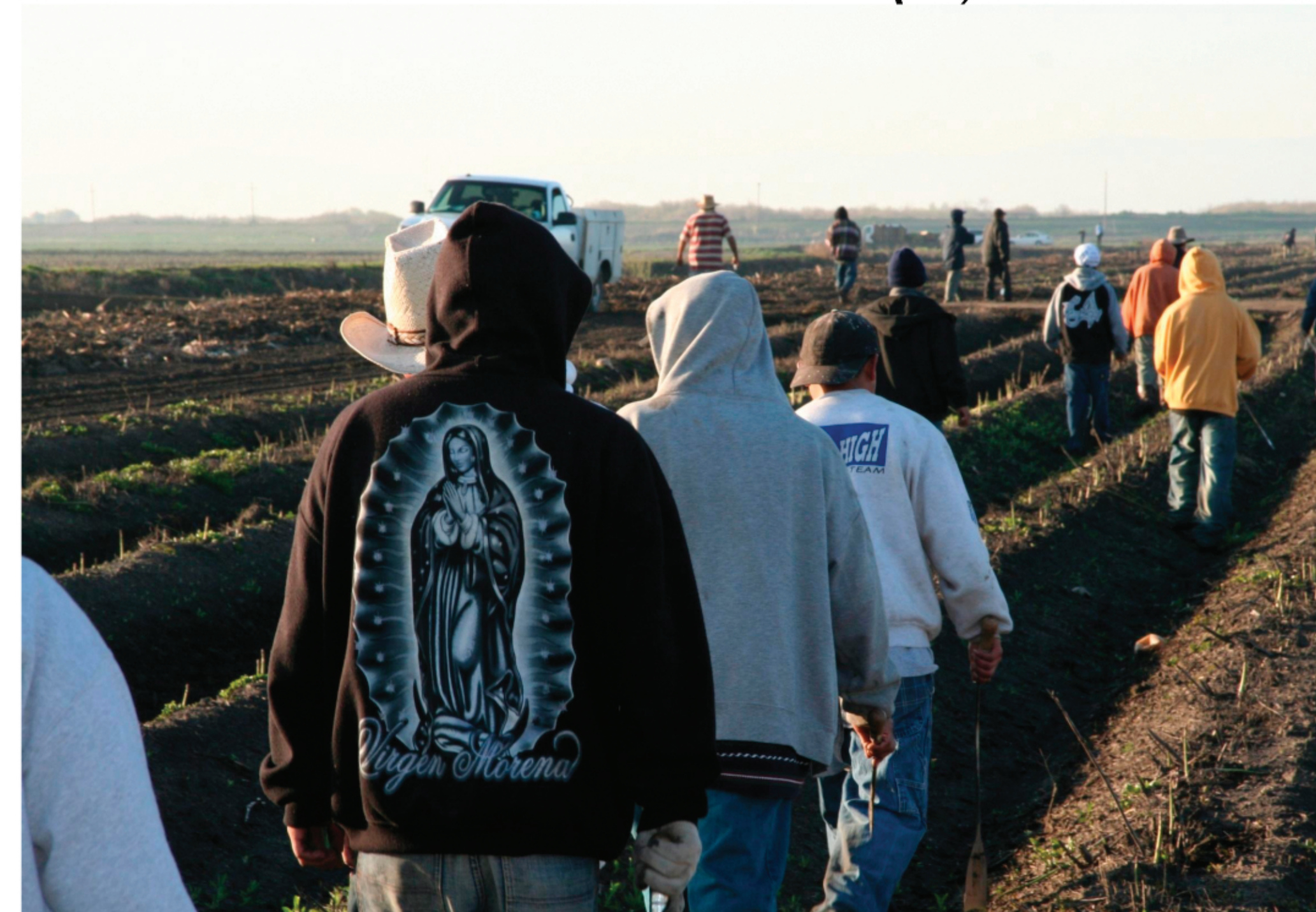
Welcomed by those who are often not welcomed

Creighton University and the Catholic Migrant Farmworker Network are unified in their faith commitment to social justice, dignity, and respect for all. Both institutions work tirelessly to bridge the differences and distances that separate the human family.