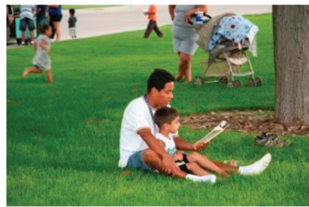
Literacy Project 10,000+ free Children's Books distributed