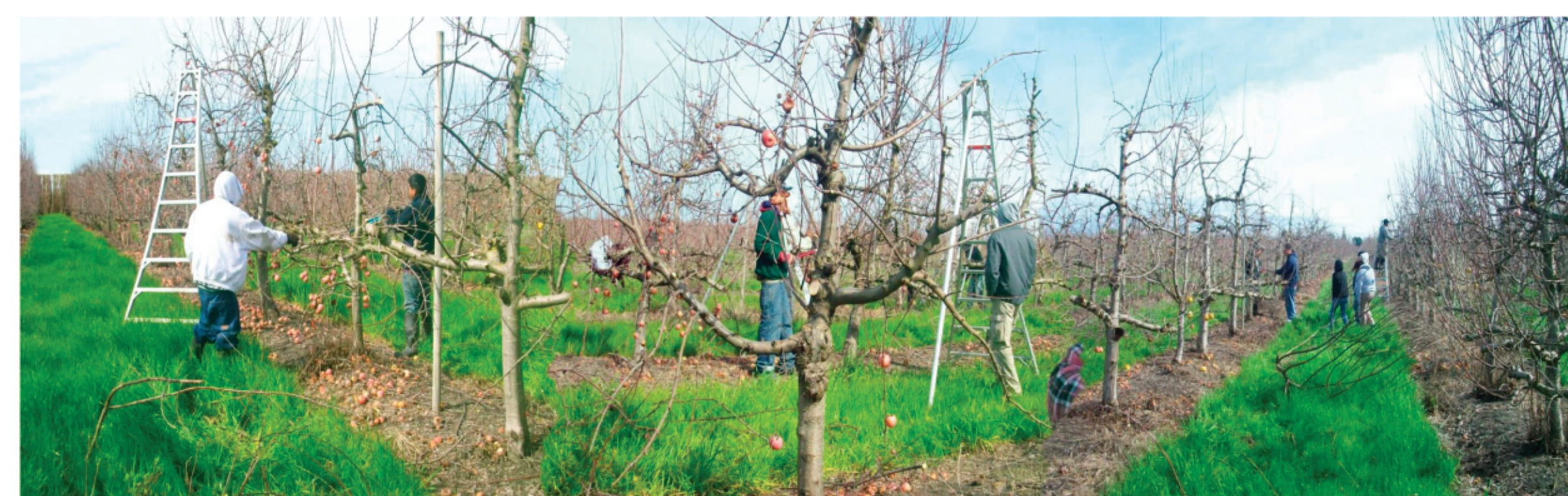
Skilled Labor: Pruning Apple Tree's in rural communities of Ohio

We have received the following honors: 2009 Creighton University Academic Excellence and Assessment Grant and 2010 University of Nebraska Omaha: College of Public Affairs and Community Services Award for Excellence in Public Service.