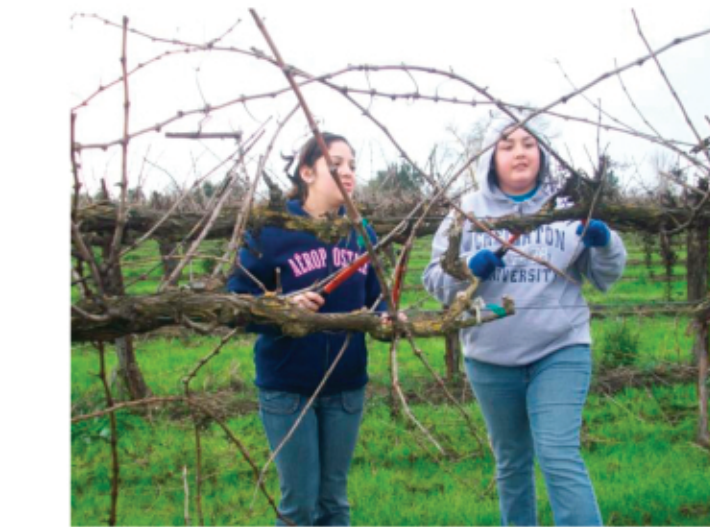
Pruning grape vineyards Fresno, California