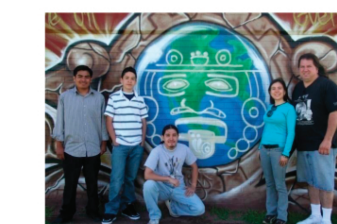
Legal Advocacy Team Scottsbluff, NE