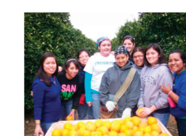
Orange Harvest Fresno, California