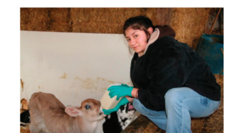
Dairy Production Rural Ohio