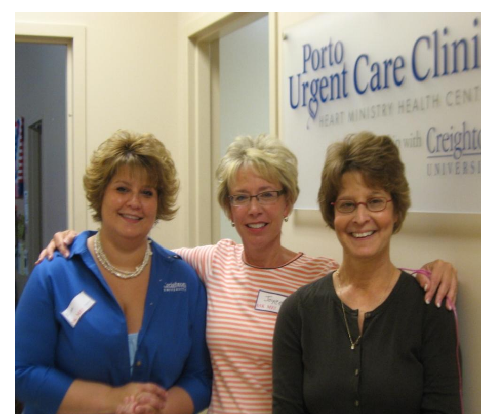
Nursing and Pharmacy