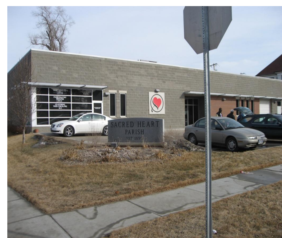
Heart Ministry Center