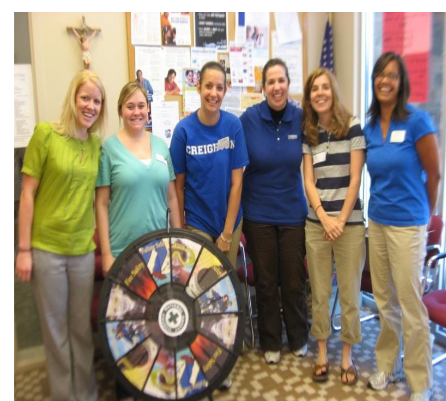
Pharmacy, Physical and Occupational Therapy