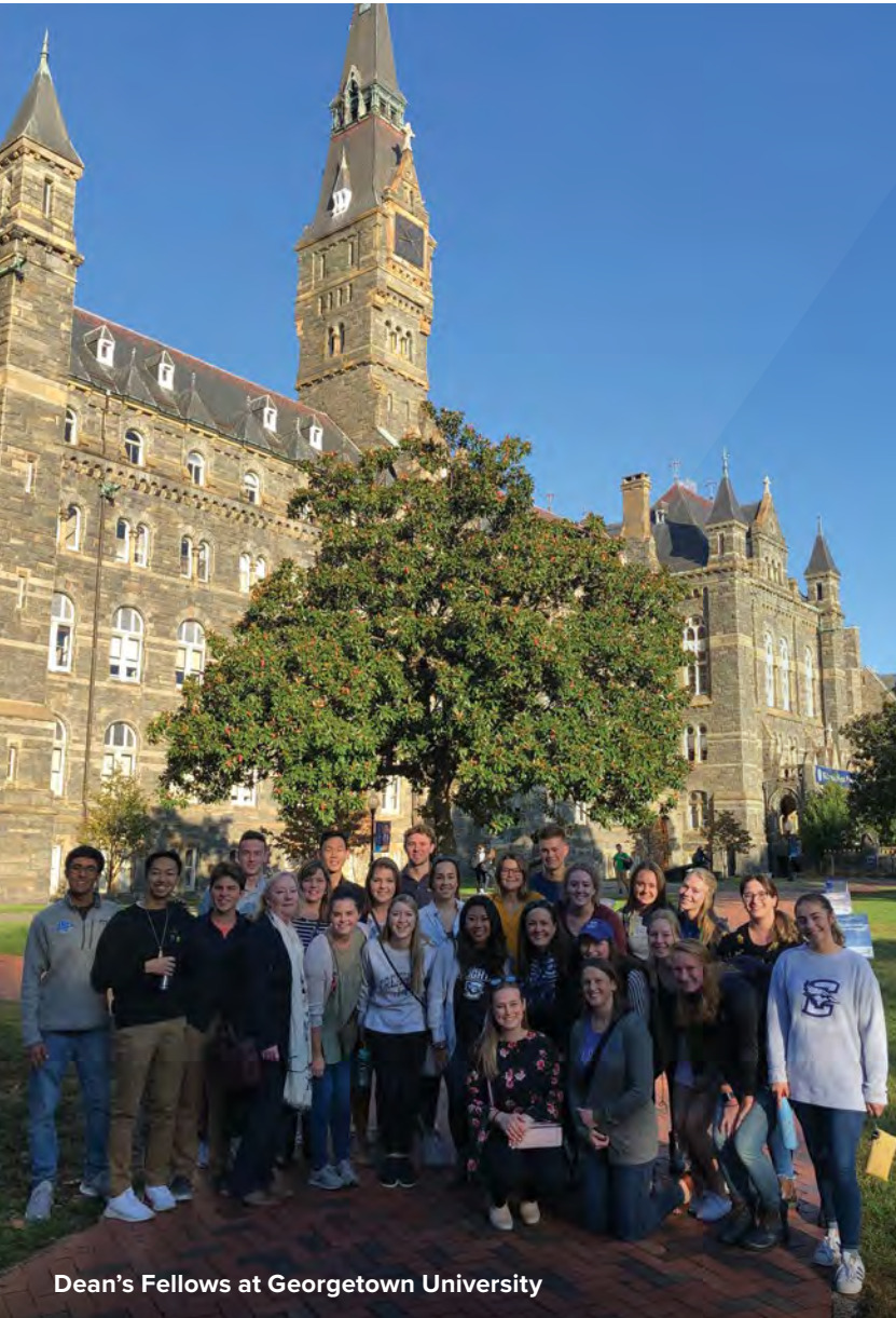
Dean's Fellows at Georgetown University