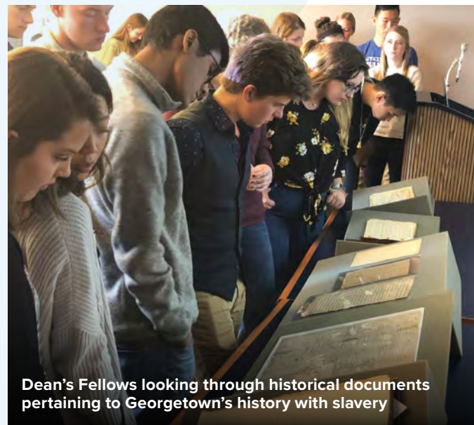
Dean's Fellows looking through historical documents pertaining to Georgetown's history with slavery