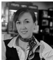
The Casper Professorship (2014)