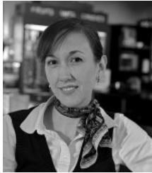
The Casper Professorship (2014)