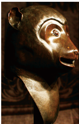
Monkey, bronze head from Zodiac Fountain, 18th century, Qing Dynasty, China, designed by Giuseppe Castiglione, S.J.