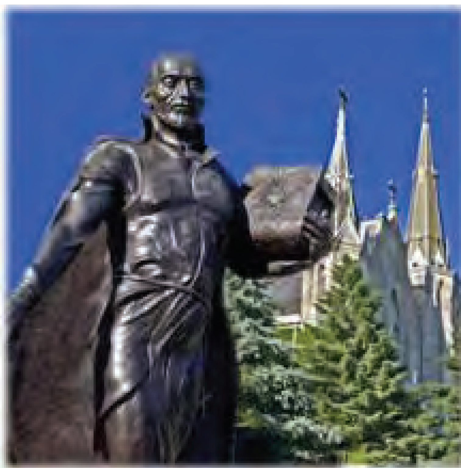
Creighton University campus

The College of Arts and Sciences partners with the University Office on Collaborative Ministry, the other undergraduate colleges, the Center for Catholic Thought, and the CU Jesuit Community to pair junior faculty members with senior faculty colleagues in a mentoring relationship to support the mission of the University.