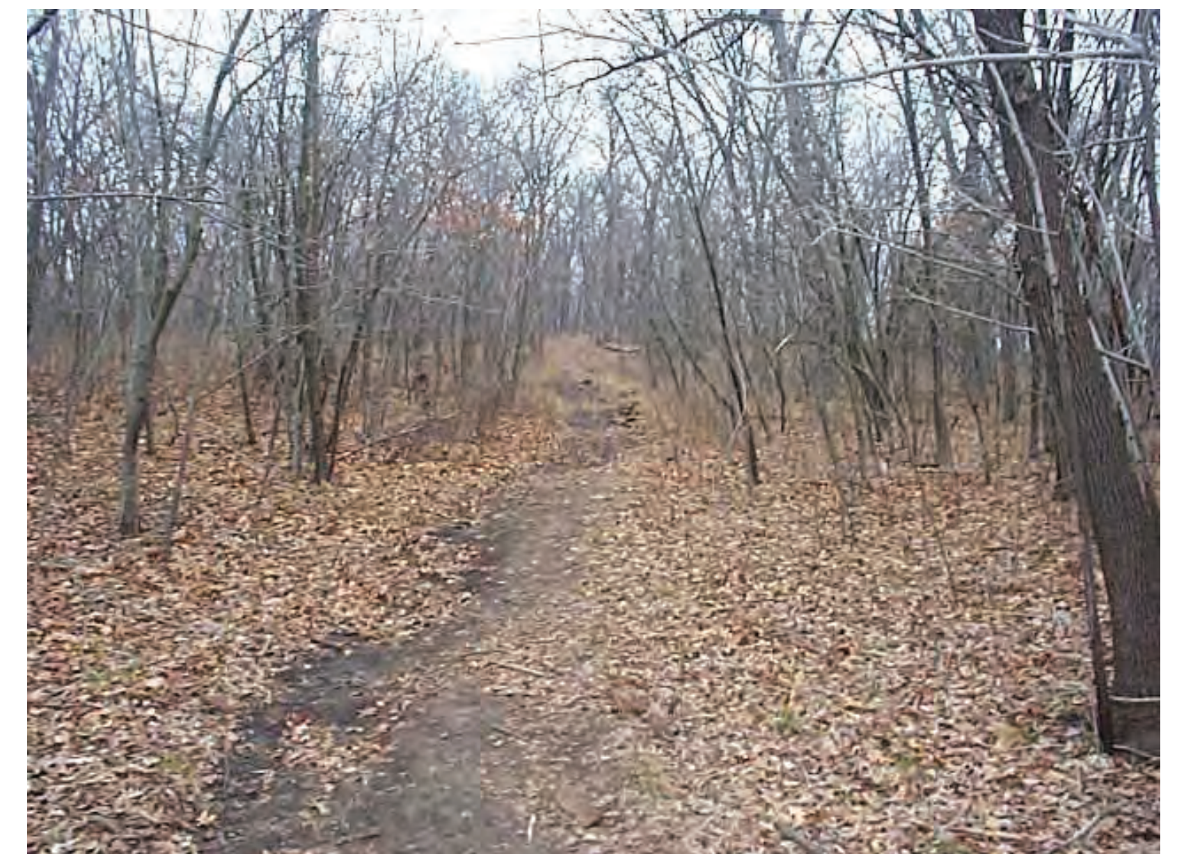
Forest pathway in Griswold, IA.