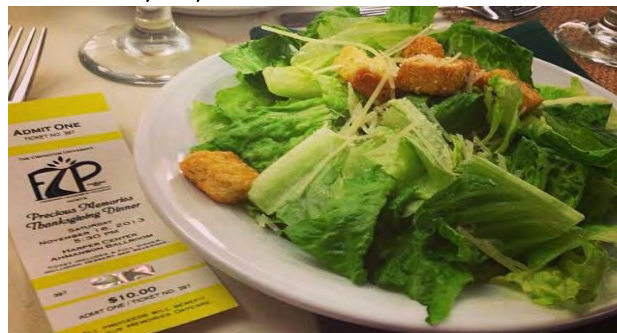
First course and ticket from the 2013 FLP Thanksgiving Dinner

Everything presented and experienced in FLP would mean nothing if such were not personal. As a requirement from the program, the freshmen complete a portfolio project come the end of each academic school year. The portfolio lives up to its name: it is each student's reflection, growth, realizations, and potentials bundled into a single, tangible space. Completion of the portfolio not only symbolizes completion of FLP, but it is a resource for each member to take and to use throughout the rest of their Creighton experience and beyond. The portfolio allows FLP, and all its memories, to last and resonate within each person beyond the scope of the program itself. In addition to compiling one's own portfolio, each freshman presents his or her portfolio to other freshmen, allowing for both self-growth and communal growth. Through the completion of this project, freshmen not only realize just how much the past year has impacted them, they realize just how powerful and how special of leaders they truly are.