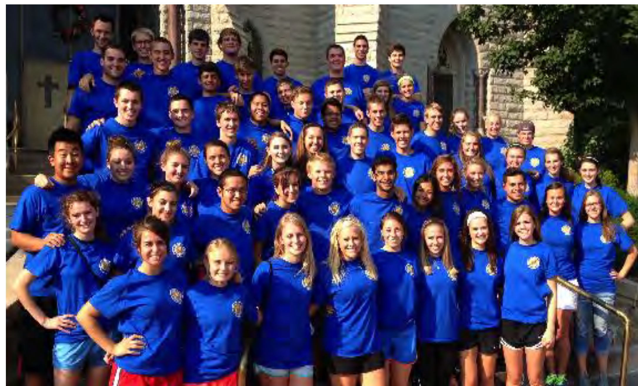
The 2013-14 class of the Freshman Leadership Program

FLP is a living/learning community geared to instilling leadership principles from various leadership models into its participants. Through a year-long program, Ignatian tradition is infused via the following five program components: fall retreat, community activism, weekly service, seminar, and the portfolio.