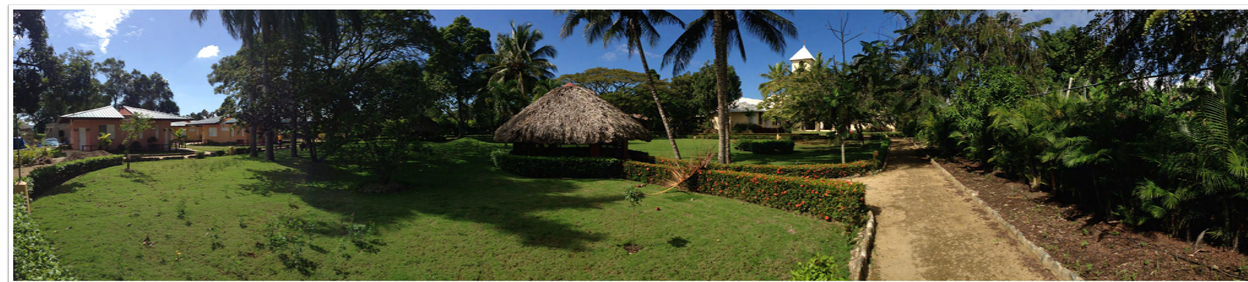
Sponsored by the Creighton University Jesuit Community, in association with the Deghman Center for Ignatian Spirituality.

Its Vision is to be an institution recognized for the integral development of the human being by promoting self-management and sustainable development of communities. The ILAC Office at Creighton partners with the ILAC Center to organize and facilitate experiences for 550 participants in 26 high school, university, and medical/surgical programs annually