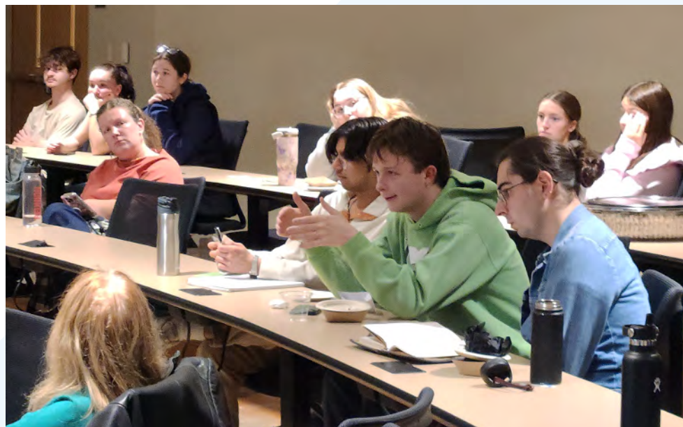
A student makes a point during discussion following the film "How to Blow Up a Pipeline."

We hope to co-host similar events in the 2025-2026 academic year.